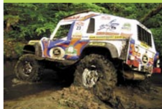
Tomcat bodywork lends itself to the application of sponsors' stickers and logos