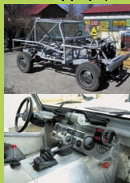
Although not spacious, two men can easily fit in here