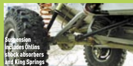
Suspension includes Öhlins shock absorbers and King Springs

Engine: 4.6-litre V8 Power: 295bhp @4800rpm Torque: 309lb ft 2600 rpm Capacity: 4554cc Tyres: Simex Extreme Trekker 35x16in