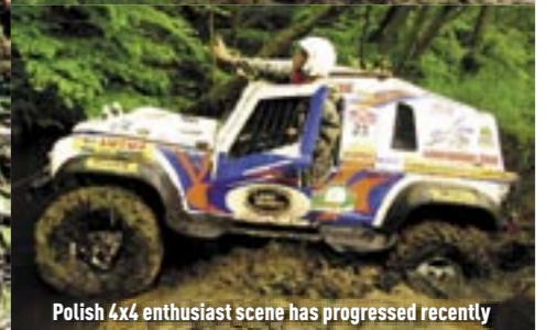
Polish 4x4 enthusiast scene has progressed recently

vehicle, a 1982 Range Rover Classic that I had driven so often it had "lost" its body,' Piotr says. 'I still use it today when participating in rallies or planning race routes. It may look clumsy, but it's a really efficient vehicle.'