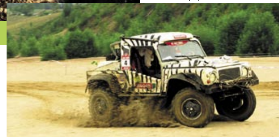
'Daktari' paintjob and Range Rover alloys indicate an early incarnation of the Kowal Tomcat

anyway). Instead, a minicam in the back transmits images to a monitor in the cab.