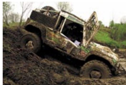
Vehicles built for challenge events need to be tough and reliable to cope with these conditions regularly

Driving Piotr's Tomcat is fairly easy thanks to its Range Rover automatic transmission (ZF 4HP22) with Raybestos Sport clutch plates. It has an early Defender transfer box (gear ratio 1:1.6) and manually-lockable central differential. The final Range Rover parts that were donated were the driving axles with Maxi-Drive