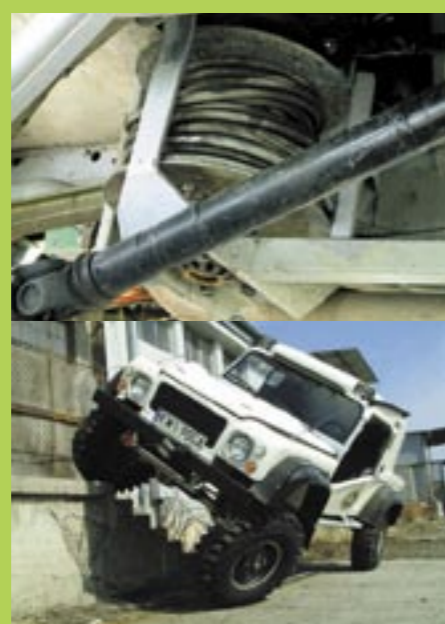
Tomcat's axle articulation is impressive