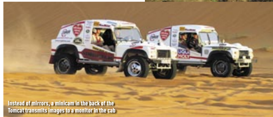
Instead of mirrors, a minicam in the back of the Tomcat transmits images to a monitor in the cab

The Tomcat's cab is designed for two people, with bucket seats and multi-point seat-belts for safety. Although the interior isn't spacious, two well-built men can easily fit in. Getting in the high cab is quite a challenge, so doors are usually removed before a race, and the Tomcat has no mirrors (they'd get damaged on the road