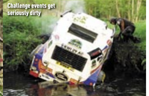
Tomcats offer great power to weight ratio