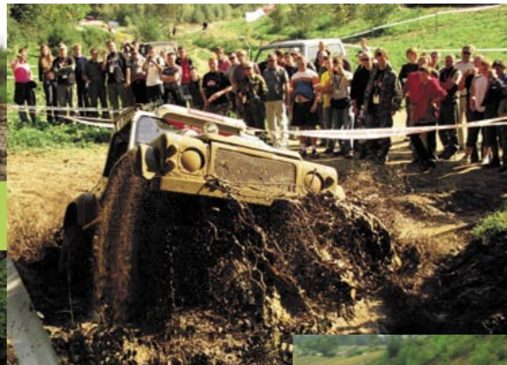
Thanks to huge 35in Simex tyres Tomcat owners can drive fearlessly in the toughest possible conditions

locking mechanism, axle shafts and heavy duty U-joints.