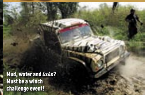
Mud, water and 4x4s? Must be a winch challenge event!